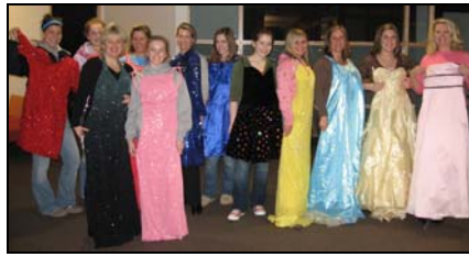
National Charity League (NCL) Work Party Volunteers

Do you have a formal gown to donate? We need prom, special occasion or bridesmaid gowns that are new or gently used, clean, fashionable and in good repair. We are also accepting wraps and purse donations that are appropriate for the prom. If your business or office would be willing to collect donations for Abby's Closet, please let us know. Thank you to the following businesses who have recently volunteered to help (others are listed on our website): KASSEL IMPORTS (Sherwood), BELLA PEARL (NW Portland) and TUALATIN DRYCLEANERS (Tualatin).