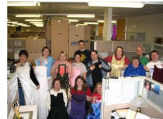
Nike Volunteers - Sorting and Boxing Donations

Thanks to Kuni BMW for inviting us to help celebrate the grand opening of their beautiful new showroom on Canyon and Hwy. 217 in Beaverton, Oregon. [Kuni has been a donation drop-off site for us.] We especially appreciated the opportunity to share information about our organization with your many guests. We also thank all of the women at Kuni who very generously donated the beautiful gowns they wore that evening. Thank you so much!!